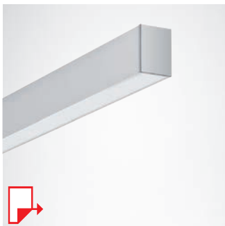
pg 72 SL764+ RE