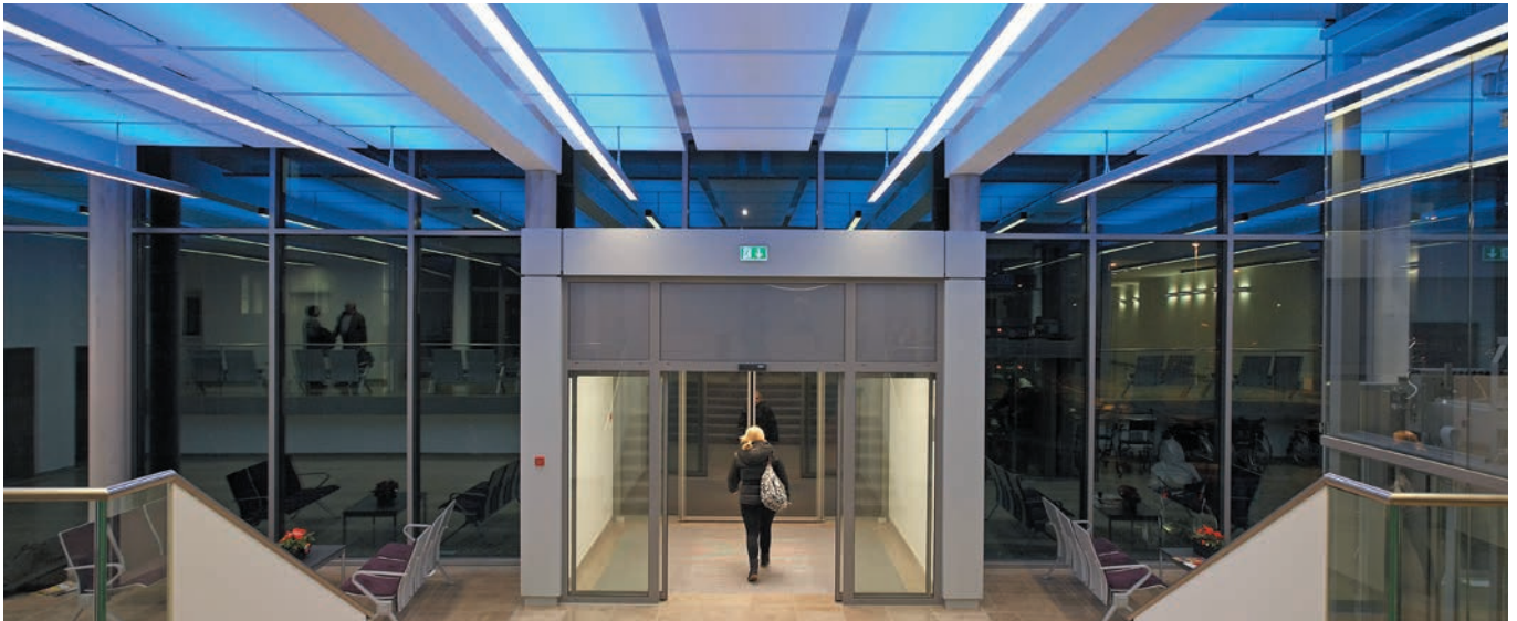
Bethanien Hospital - Moers - Germany